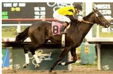
El Gato Malo

El Gato Malo (El Corredor) has indeed proved to be one bad cat in his two starts to date. The West Point