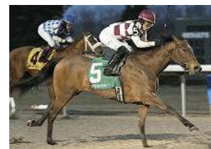
Our Dancing Babe