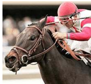
Precious Kitten