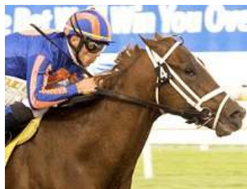
Talk of a Cat