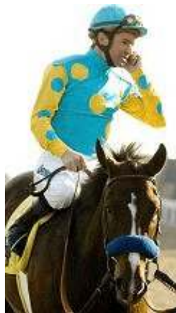
Massive Drama

The first two finishers from the Dec. 22 GI CashCall Futurity, Into Mischief and Colonel John, will skip this race, but three of those they beat that day return here. Massive Drama (Kafwain), winner of the Nov. 22 GIII Hollywood Prevue S. in his second start, stalked the pace last time and angled outside for running room in the stretch, but couldn't get past the top two and was third by 1 3/4 lengths. The race didn't go exactly as trainer Bob Baffert had envisioned. "I thought he would be on the lead, but they were all rushing," Baffert told Daily Racing Form . "[Jockey Kent Desormeaux] thought he would relax, but he never really settled." Massive Drama will have Rafael Bejarano in the irons this time, and he will break