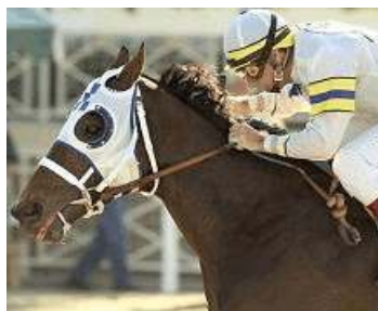
Sierra Sunset

Indian Sun (Indian Charlie), runner-up in the GIII Generous S. on the Hollywood lawn, was making his Cushion Track debut in the Futurity. At the back of the pack early, he gained some ground late to be fifth, beaten 3 1/2 lengths. Cal Cup Juvenile hero Sierra Sunset (Bertrando) was looking to make it three in a row in his first try against Grade I company, but, after sitting just off the leaders in fifth, he failed to launch a late bid and finished sixth, just a nose behind Indian Sun.