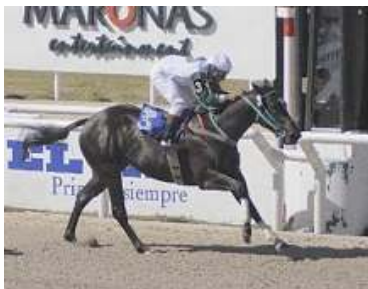
Wra Black

Wrangler (Carson City--Fighting Jet, by Copelan), who won the 2002 GII General George H. for his owner and breeder Stronach Stables, is off to a strong start at stud in Uruguay. Exported to South America by a group