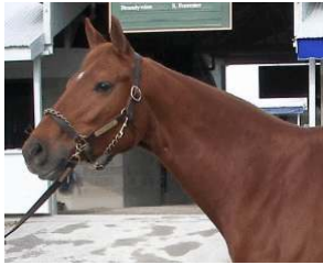
Yes She Is