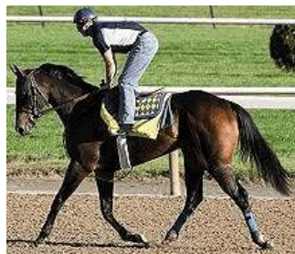
Indian Blessing

Making her first start of the season is likely Juvenile Fillies champion Indian Blessing , undefeated in three starts last year, including the GI Breeders' Cup Juvenile