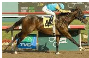
Massive Drama