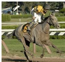
Irish Smoke