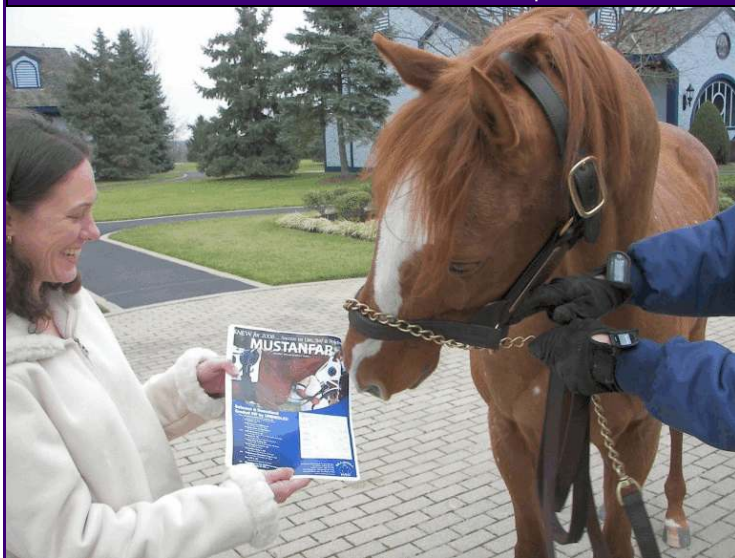
Mustanfar reading about...Mustanfar in the TDN!

Serving your horse insurance needs for over 25 years (859) 231-0213 • Fax (859) 231-0206 • E-mail: office@equineinsurance.com