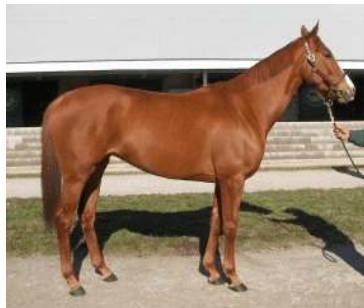
Vague Notion