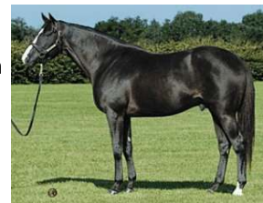
Repent