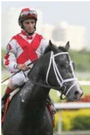
Half Ours

Half Ours , by Unbridled's Song, showed blinding speed to win a five-furlong stakes at Churchill Downs in May of his two-year-old year by four lengths, and brought a final bid of $6.1 million at the 2006