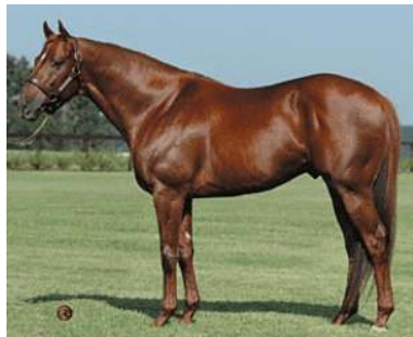
Peace Rules

Peace Rules , a Grade I winner at three (Blue Grass S., Haskell Invitational) and four (Suburban H.), and third in the GI Kentucky Derby to Funny Cide and Empire Maker in 2003, is one of four prominent Florida prospects for the 2008 Freshman Sire list. An earner of over $3 million by Forty Niner's beautifully bred son, Jules, Peace Rules had 50 yearlings sell last year for an average of $50,963 (per Insta-Tistics ), and a high of $220,000. Even so, he barely edged out the previously unknown Spanish Steps , an unraced full brother to Unbridled's Song, for leadership among Florida's first-year