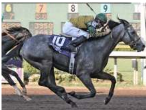
Going Ballistic

Lite the Fuse , a son of Buckaroo who won six stakes sprinting, including the GI Carter H. twice (he also ran second twice in the GI Met Mile), has stood in several different states or provinces, and has defied the odds to be a very decent stallion everywhere. In 2007, he had GII Super Derby hero Going Ballistic . An interesting new recruit to Pennsylvania for 2008 is Service Stripe , a Pin Oak-bred son of Deputy Minister who ripped up the record books in Michigan, then stood for five seasons at Crestwood Farm in Kentucky. He had a mid-year 2007 APEX A Runner Index of 2.31, and had 18 winners listed in TDN Progeny PP's from his first three Kentucky crops in just the last three months of last year.