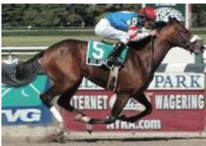
Big Truck