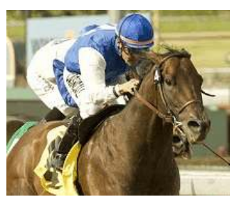
In Summation

H. at Santa Anita, but it was GISW In Summation (Put It Back) who stole the show. Sitting a perfect trip trailing the field of four while Idiot Proof dueled through wicked fractions of :21.01 and :43.25, the 3-1 second choice revved up four wide in the stretch and drew away to post a one-length victory over Barbecue Eddie (Stormy Atlantic) while setting a new track re-