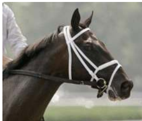
Cowboy Cal

Cowboy Cal was unveiled at Saratoga in late August, sprinting six furlongs on the dirt. He chased the leaders from a wide perch that day before fading to be seventh, beaten 11 1/4 lengths. Moved to the sod next out, he