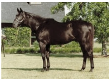
Kris S.

He retired to stud at Meadowbrook Farm, Ocala, for the 1981 breeding season at a fee of $3,500. After a