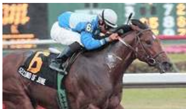
Second of June

Making his first start since finishing a game second to Read the Footnotes in the GII Fountain of Youth S. in mid-February, Second of June (Louis Quatorze) fell a neck short of Smooth Lover (Suave Prospect) in yesterday's sixth race at Calder, a $62,500 optional claimer. The three-