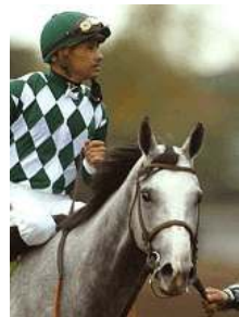
Alphabet Kisses

The versatile Alphabet Kisses had beaten fellow Cal-breds in a pair of sprint races at Hollywood this spring, then made it three in a row in an optional claimer going a mile and a sixteenth on the grass June 10. She returned to the dirt to be second in the July 24 Fleet Treat S. and third in the Sept. 4 Torrey Pines S., but tired after showing brief speed in the Oct. 16 Cal Cup Distaff H. down the hill at Santa Anita and finished ninth. Freshened after that performance, the sophomore made her return in an optional claimer at a mile and a sixteenth on the Hollywood main track Dec. 3 and, with