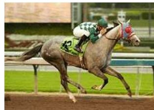
Alphabet Kisses

She was sent off a 20-1 outsider, but Alphabet Kisses (Alphabet Soup) held 8-5 favorite Bending