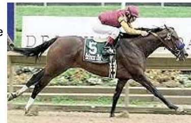
Yearly Report

the task at hand is a daunting one, given the presence of Golden Eagle Farm's Yearly Report (General Meeting). A winner of five of her seven trips to the post this year, the Bob Baffert trainee enters off a track-record setting victory in the Oct. 29 Stonerside S. at Lone Star Park. Connections are hopeful of closing the year on a high note.