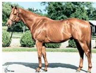
Carson City

CARSON CITY DEAD Carson City (Mr. Prospector--Blushing Promise, by Blushing Groom {Fr}), a leading sire of speed over the past decade, died Friday in his stall at Overbrook Farms in Kentucky. He was 17. The