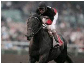
Rock Hard Ten

Rock Hard Ten (Kris S.) overcame a sluggish start and an adventurous stretch run to take yesterday's GI Malibu S. on opening day at Santa Anita. Reunited with Gary Stevens for the first time since the pair finished