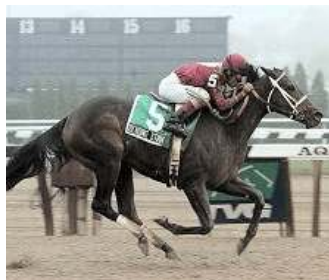
Bending Strings