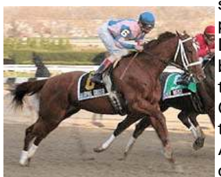
Galloping Grocer at the start of the Remsen

GII Remsen S. runner-up Galloping Grocer (A. P Jet) has been given some time off from serious training, but is set to embark down the GI Kentucky Derby trail on a