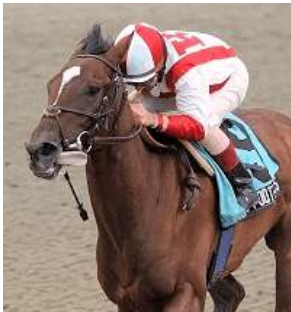
Read the Footnotes

READ THE FOOTNOTES TO SEQUEL Klaravich Stable's Read the Footnotes (Smoke Glacken--Baydon Belle, by Al Nasr {Fr}), who was retired last week due to arthritic changes in his knee, has been purchased by