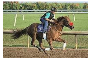
Sharp Lisa

Today's GI Hollywood Starlet S. could provide Dixieland Band with his 100th stakes winner if his two-year-old daughter Sharp Lisa can come through. Listed as the 5-2 second choice on the morning line, the chestnut was acquired privately following her September debut win at Calder and missed by just a head in the GI Darley Alcibiades S. Oct. 8. She had a very wide trip when sixth in the GI Breeders' Cup Juvenile