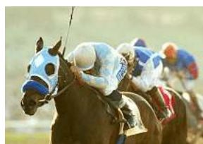
Silent Sighs at Santa Anita

SILENT SIGHS RETIRED Grade I winner Silent Sighs (Benchmark--Quiet Romance, by Bertrando) has been retired due to persistent ankle trouble, according to Daily Racing Form . The three-year-old will be sent to