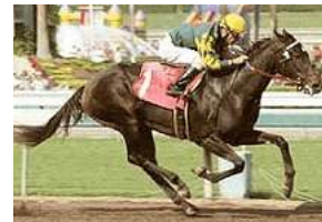
Northern Mischief Benoit

The rangy chestnut posted a facile allowance victory over track and trip as the 1-10 favorite Nov. 14 and will be tough to beat here. Northern Mischief (Yankee Victor), a half sister to champion Gourmet Girl, graduated gamely Oct. 24 at Oak Tree. The dark bay had a tough trip next out when fourth, beaten a length, in the Moccasin S. Nov. 21.