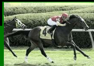
SOARING FREE Horse of the Year and Champion Male Turf Horse