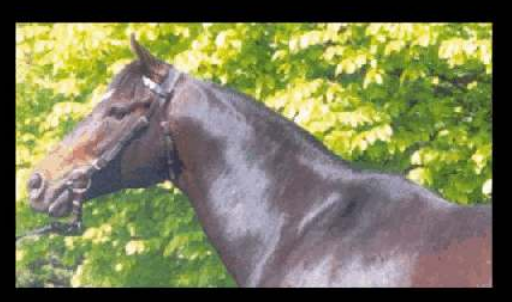
2005 Fee: $15,000 • Live foal • Payable Nov 1

Friday, STORMY KISS, a 1st crop filly by BERNSTEIN, won her 1st start in Argentina.