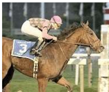
A Huevo