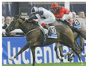
Alexander Goldrun winning the G1 Prix de l'Opera France-Galop photo

Alexander Goldrun has shown herself to be even better than Medecis. She too was second in one of the