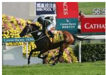
Silent Witness hkjc.com

They came from far and wide to tackle the irrepressible Silent Witness (Aus) (El Moxie) in the G1 Hong Kong Sprint and on paper it looked like the toughest assignment yet for the undefeated five-year-old. Last