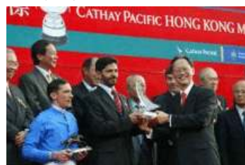
Dettori and trainer Saeed bin Suroor following the Mile

Always a staunch supporter of the International meeting, Godolphin celebrated a successful Sunday afternoon at Sha Tin. With Firebreak (GB) (Charnwood Forest {Ire})'s victory in the G1 Hong Kong Mile,