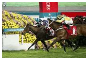
Alexander Goldrun (inside)