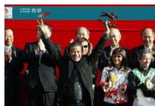
Cruz (middle) and Coetzee (right) after the Sprint

After winning two of the four Group 1 events on International Day last year (Sprint and Mile), jockey Felix Coetzee and trainer Tony Cruz put together another memorable meeting yesterday. Not only did they