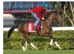
Alexander Goldrun

Alexander Goldrun (Ire) (Gold Away {Ire}), unraced since her one-length victory in the G1 Prix de l'Opera on the Arc undercard, clocked :22.1 for her final 400 meters to the satisfaction of trainer Jim Bolger. "That went perfectly, just what I wanted," he explained. "She's in good form and it's possible she's improved since her last run."