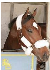
Sense of Style Lone Star Park

Another Biancone charge who's proven she can run is Sense of Style. When the attractive bay exploded onto