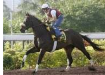
Battle Won

Battle Won (Honour and Glory), the lone American hope at the meeting, galloped an easy half mile beneath