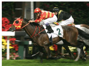
Take scoring in the first