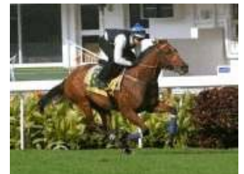
Yell