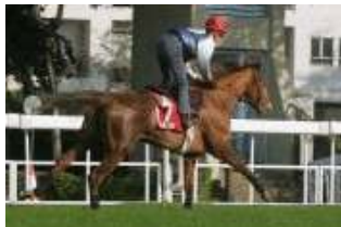
Lattice

Prior to his success in the International Jockeys' Championship, Christophe Soumillon was on hand to put G1 Prix de Diane winner Lattice (Ire) (Inchinar {GB}) through her paces as she worked over the Sha Tin turf course in company with fellow Cup aspirant Touch of Land (Fr) (Lando {Ger}) and defending Hong Kong Vase champion Vallee Enchantee (Ire) (Peintre Celebre) yesterday. Since running her record to four-for-four