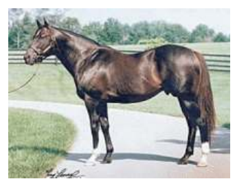
Storm Cat, the leading sire son of Storm Bird

Storm Bird (Northern Dancer--South Ocean, by New Providence), the European champion who went on to sire top stallion Storm Cat, was euthanized at Ashford Stud in Kentucky Dec. 3 following a bout of colic. He