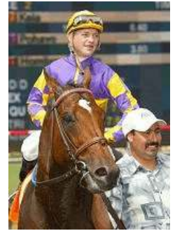
Kela