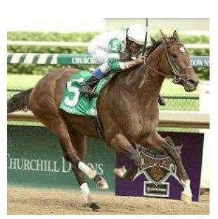
Champali Four Footed Fotos