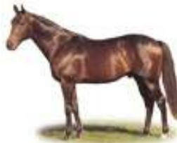
Broad Brush