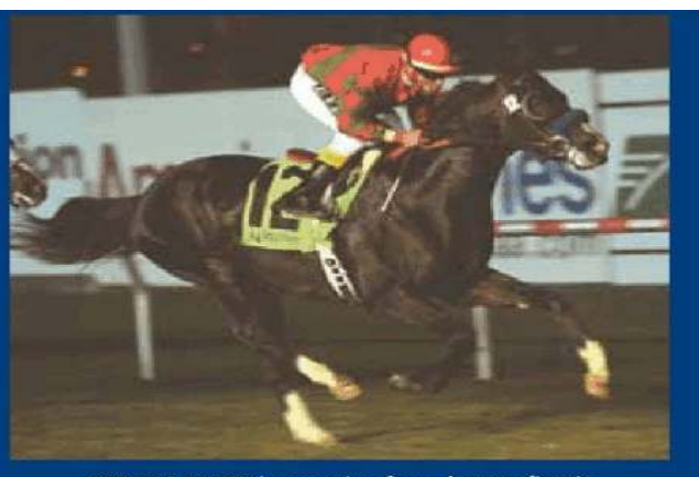
STORM MATE impressive from last to first in MSW debut at Hollywood.