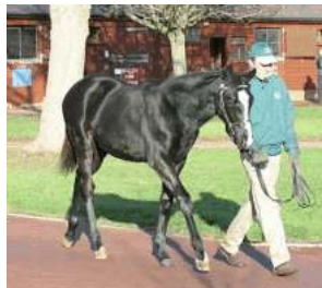
Singspiel-Bosra Sham colt sold for 525,000gns in '03 Tattersalls

Following a testing round of yearling sales, resilient pinhookers were out in force at Newmarket yesterday, looking to reinvest at the Tattersalls December Foal Sale, which begins this morning at 10 a.m. A total of 1,115 foals have been catalogued for the sale and, although fireworks will be thin on the ground today--the weakest of four days--there are some excellent pedigrees on show during the week. Four members of Danehill's final crop are scheduled to appear, including lot 988 , a filly out of G1 Irish Oaks heroine Knight's Baroness (GB) (Rainbow Quest) bred by Bjorn Nielsen; and lot 1262 , a 3/4-sister to top sprinter Owington (GB) (Green Desert) consigned by