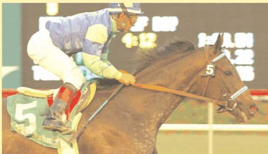
Undeclared Declan's Moon, by Malibu Moon, wins Hollywood Prevue (G3).

2003 Highest Beyer Speed Figure by a 2-Year-Old included: