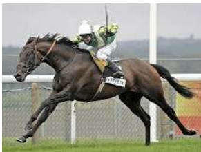
Rakti at Ascot