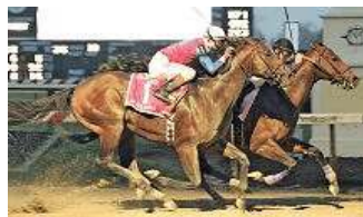
Wildcat Heir wins De Francis