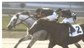
Mark One (grey)

A veteran of the Woodbine racing scene, Mark One recorded a seasonal high 103 Beyer Speed Figure when winning an allowance in the slop here last May before