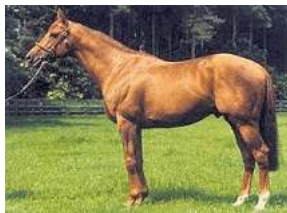
Kris (1976-2004)

KRIS DEAD A champion on the racecourse who became a leading sire, Kris (GB) (Sharpen Up {GB}--Doubly Sure {GB}, by Reliance {Fr}) died of heart failure in his paddock at Plantation Stud. The 28-year-old stallion had been pensioned since 2002. A full brother to champion and successful sire, Diesis (GB), Kris was honored as Europe's top miler at both three and four. He won 14 of 16 career starts for trainer Henry Cecil, capturing the G1 Sussex