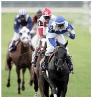
Better Talk Now

BETTER TALK NOW TO RETURN IN HOLLYWOOD TURF CUP Better Talk Now (Talkin Man), who upset favored Kitten's Joy (El Prado {Ire}) in the GI