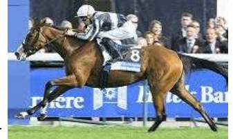
Divine Proportions