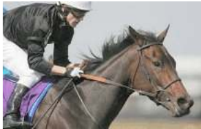
Ouija Board