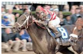
Runway Model