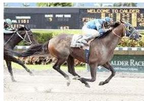
Gold Dollar

Miss Kitty (Storm Cat), an unraced two-year-old sold as a broodmare prospect, brought a bid of $280,000 to top Tuesday's session of the Keeneland November