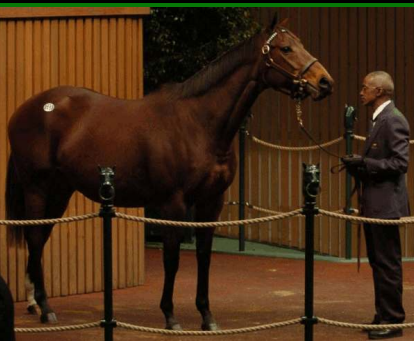
Hip 113, $2,000,000, i/f Mineshaft