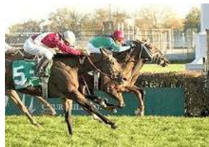
River Belle (ctr)

Paul Revere warned us back in 1775 and his words held true in the GII Mrs. Revere S. at Churchill Downs yesterday. British-bred River Belle (GB) (Lahib), ridden by six-time champion British champion jockey Kieren Fallon, outfinished Lenatarese (Broad Brush) and Cape Town Lass (Horse Chestnut {SAf}) to take the three-way photo and her first U.S. stakes.