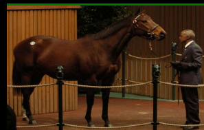
Hip 113, $2,000,000, I/F Mineshaft