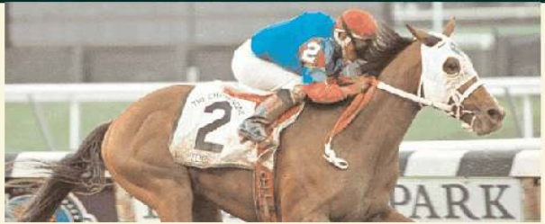
At 2, won Champagne (G1), Hollywood Futurity (G1) and Remsen (G2).