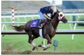
Gold Storm

Former Kentucky Governor Brereton C. Jones added to his broodmare band yesterday at Keeneland, going to a session-best $270,000 for Storm Teal (Storm Bird) from the consignment of Hill 'n' Dale Sales Agency. The 12-year-old mare, carrying a foal by Hill 'n' Dale stallion El Corredor, has been well represented this year at the races, as she is the dam of Gold Storm (Seeking the Gold), winner of the Arlington