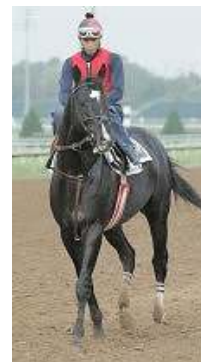
Roses in May