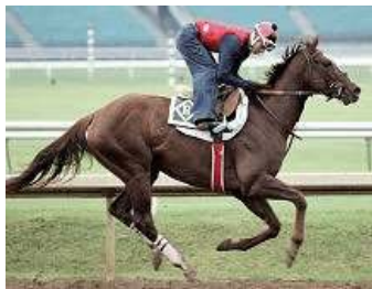
Kitten's Joy