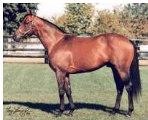
Awesome Again www.adenastallions.com