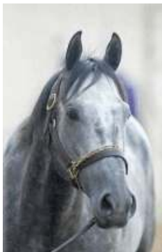
Even the Score