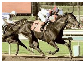
Rock Hard Ten