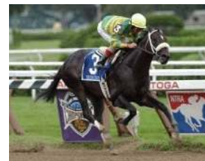
Covering sire of hip 1158, Orientate