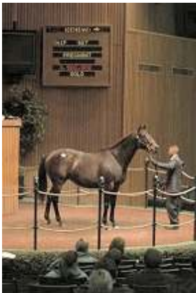
Session-topping Helsinki