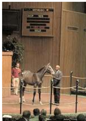
Hip 928 by Unbridled's Song

Just moments after Helsinki (GB) caused multi-million fireworks in the Keeneland pavillion, her weanling daughter by Unbridled's Song kept things going with a flashy price tag of her own.