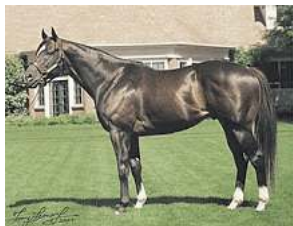
Dixie Union www.lanesendfarm.com