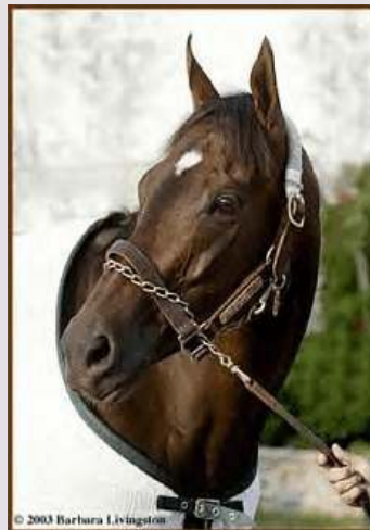
IPI TOMBE 2003 Dubai Horse of the Year 2002 South African Ch. 3yo Filly