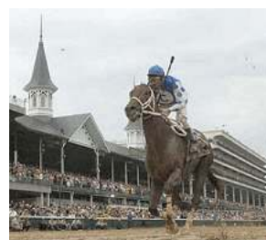
Smarty Jones Horse photos

Heading into yesterday's November Selected Sale hosted by Fasig-Tipton, many anticipated that fireworks would be generated from the sale of the dam of Kentucky Derby and Preakness hero Smarty Jones. Hip 257, I'll Get Along (Smile), who was consigned by Cloverleaf Farms II, did not disappoint when she reeled