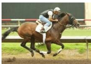
Pleasantly Perfect

Selling in foal to Dixieland Band, this four-year-old filly is a half sister to Pleasantly Perfect (Pleasant Colony), the G1 Dubai World Cup and GI Breeders' Cup Classic hero, who was retired to stud this past week as the fourth leading money earner of all time. The bay is also a half sister to Hurricane State (Miswaki), a Group 3 winner in France at two.