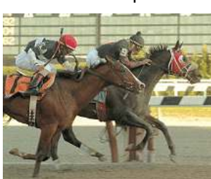
Accurate is right on target A Coglianesse

Accurate followed a maiden win at Saratoga versus statebreds Sept. 5 with a third in the Bertram F.