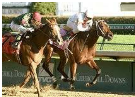
Punch Appeal (inside) wins Pocahontas Four Footed Fotos

Buy into America's *Leading 2-Year-Old Sire SUCCESSFUL APPEAL through his top daughter PUNCH APPEAL , winner of: Saturday's $100,000 Pocahontas S. at Churchill Downs and... $100,000 Kentucky Cup Juvenile Fillies & $100,000 JJs Dream S.