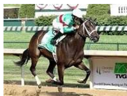
Be Gentle 4 Footed photo