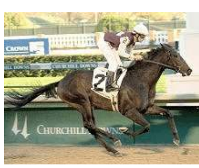
Four Footed Fotos

Straight Line lived up to his name in the stretch run here, pulling away to win impressively and earning his