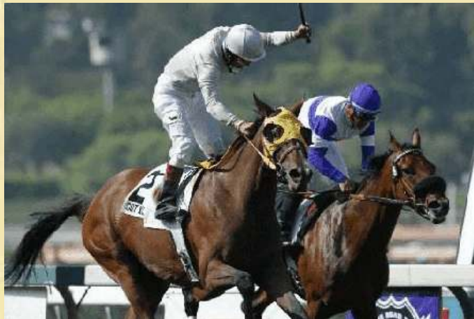
GOT KOKO defeats Elloluv, Azeri and Adoration in the Lady's Secret Breeders' Cup H. ( G2) at Santa Anita.