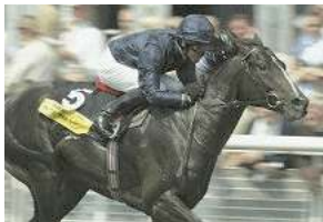
One Cool Cat