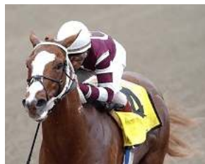
Cuvee