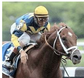
Speightstown