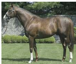
Giant's Causeway

A $1-million Keeneland July yearling, Monashee Mountain began covering mares with less fanfare than the aforementioned duo, but is second only to Giant's Causeway on the European first-crop sires table. The son of Danzig--Prospectors Delite has been represented by 14 individual winners and four stakes winners to date. The bay will stand for a fee of $10,000 live foal.