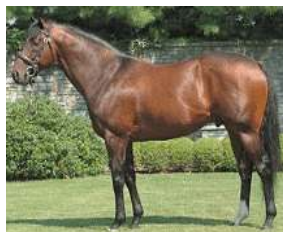
Fusaichi Pegasus Coolmore photo