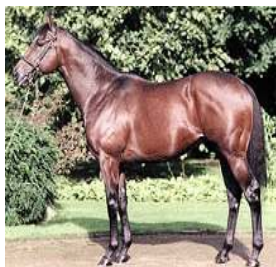
Monashee Mountain