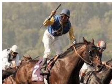
Pleasantly Perfect winning the '03 BC Classic

Diamond A Racing Corporation's Pleasantly Perfect (Pleasant Colony--Regal State, by Affirmed) has been retired from racing after suffering a minor ankle injury during his third-place finish in last Saturday's GI Breeders' Cup Classic. The six-year-old stallion, who was tentatively scheduled to make his final racetrack appearance in the G1 Japan Cup Dirt in Tokyo Nov. 28, will instead ship to Lane's End Farm in Versailles, Kentucky, where he will commence stud duties next winter. Bred by Clovelly Farms, the strapping bay was purchased as a yearling for $725,000 at the 1999 Keeneland September sale, but was diagnosed