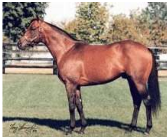
Awesome Again

With the 21st Breeders' Cup in the record books, it's clear that from a pedigree standpoint, the big winner was Awesome Again. With the GI Breeders' Cup Classic winner Ghostzapper and Wilko, who took the GI Breeders' Cup Juvenile, the Adena Springs stallion has a certain Horse of the Year as well a strong candidate