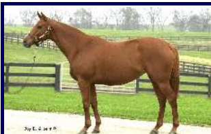
Click here for larger photo

All horses in the TDN are bred in North America, unless otherwise indicated