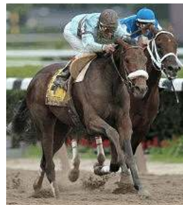
Birdstone wins the Belmont