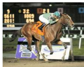
Nashua hopeful Favalora Equi-Photo

Aqueduct will offer special Election Day racing today, with a pair of juvenile stakes highlighting the holiday card. Six colts and one gelding will line up for the GIII Nashua S., while five juvenile fillies will go postward in the GIII Tempted S. In the Nashua S., trainer John Servis will saddle 2-1 morning-line favorite Rockport Harbor (Unbridled's Song). The gray colt is unbeaten in