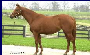
Click here for larger photo

REALITY ROAD (Believe It), Meadowbrook, $3K, 16/5/0 8-TUP, Stk, 6f, Joe On the Aisle, $4K OBS AUG yrl