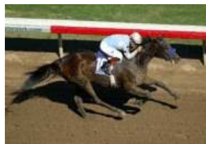
Sweet Catomine

Sweet Catomine (Storm Cat) came into yesterday's Breeders' Cup Juvenile Fillies shouldering great expectations and she proceeded to surpass those high hopes with a convincing 3 3/4-length victory over Balletto