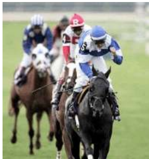
Better Talk Now

All the pre-race hype was on Kitten's Joy (El Prado {Ire}), but it was 27-1 longshot Better Talk Now (Talkin Man) who bumped and weaved his way to a 1 3/4-length win in yesterday's GI Breeders' Cup Turf S. The five-year-old gelding won the GI Sword Dancer Invitational H. over a yielding Saratoga course at the Turf's