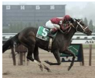
Bending Strings

Bending Strings has been keeping top company all year, winning the GII Nassau County Breeders' Cup S. in May, running fourth in the GI Acorn S. in June and finishing second in the GI Test S. Most recently, the dark bay filly was a 2 1/2-length victress in the Oct. 2 GIII Safely Kept Breeders' Cup S. at Pimlico. In this one,