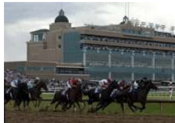
Ghostzapper (right) leads the field in the Classic