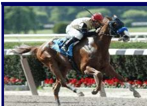
FRIENDLY MICHELLE