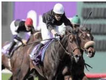
Ouija Board

The ultra-consistent Ouija Board (GB) (Cape Cross {Ire}) added another victory to her impressive resume with a sterling 1 1/2-length victory in yesterday's GI Breeders' Cup Filly & Mare Turf. The three-year-old filly scored a double this past summer with wins in the G1