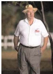
Allen Jerkens

Bowman's Band (Dixieland Band) may be a 50-1 longshot in the Classic, but don't count him out. The hard-knocking six-year-old is trained by "The Giant Killer" Hall of Famer H. Allen Jerkens. "They've accused me of that before," Jerkens said of the moniker. "But I never have been all that comfortable with it. You work hard, try to get your horses in the right spots and try to get lucky." Among his historic upsets: Horse of the Year Kelso was defeated three times by the Jerkens-trained Beau Purple; Handsome Boy upset Buckpasser in the 1963 Widener H.; Secretariat was twice beaten by Jerkens trainees; and 34-1 outsider Wagon Limit defeated champion Skip Away and Gentlemen (Arg) in the 1998 GI Jockey Club Gold Cup. "I look back on all that we've done and I feel good about it," Jerkens said. "But the thing about this game is that there is always something else to accomplish. For us, we've never won a Kentucky Derby or one of these Breeders' Cup races. It would be nice to do that now." Jerkens has a chance to earn that first Cup win with another longshot Saturday. "Bowman's Band is an old pro and he has been training right," he said. "So you're hoping to get a piece of the pie and maybe get lucky, too." Breeders' Cup cont. p. 2