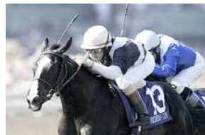
Six Perfections