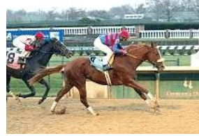
Soto

SOTO TO HIGHCLERE Soto (Dehere--Subtle Frangrance, by Crafty Prospector) will take up stud duties next season at Highclere in Lexington, Kentucky. The four-year-old captured the GII Kentucky Jockey Club S. as a juvenile in 2002 and won the GIII West Virginia Derby during his sophomore campaign. In the final start of his career, he was second behind Ten Most Wanted in the 2003 GII Super Derby.