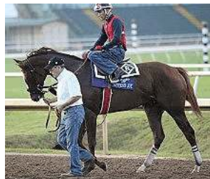
Kitten's Joy