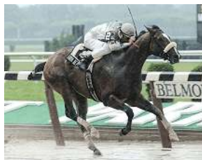
Iron Deputy

Iron Deputy to Pin Oak Lane: Graded stakes winner Iron Deputy (Silver Deputy--Femme de Fer {Fr}, by Iron Duke {Fr}) will take up stud duties next season at Pin Oak Lane Farm in New Freedom, Pennsylvania. The five-year-old bay won last season's GII Brooklyn H. and was third in the GII Saratoga Breeders' Cup H. He won the 2001 Huntington S. and the 2002 Count Fleet S. On the board in seven of 10 starts, Iron Deputy won five times and earned $370,900. He will stand his initial season for $3,000.