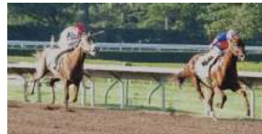
2004 Haskell

Racing in New York shifts back to Aqueduct and a field of eight will be lined up for Wednesday's opening day feature, the GIII Discovery H. My Snookie's Boy (Crafty Friend), claimed for $40,000 at Gulfstream in April, gave Lion Heart all he could handle finishing second in the GIII Long Branch Breeders' Cup S. July 17 and the GI Haskell Invitational H. Aug. 8. Off since running a well-