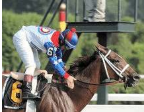
Azeri