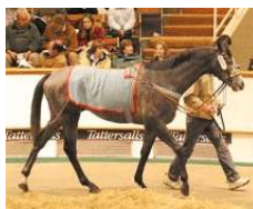
Swagger Stick Tattersalls

Swagger Stick (Cozzene), a half brother to GI Breeders' Cup Classic winner Pleasantly Perfect (Pleasant Colony), topped day two of Tattersalls' Autumn Horses In