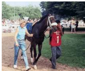
Balto Star

Balto Star (Glitterman), a graded stakes winner on turf and dirt, suffered a slight tear in his right front tendon in his most recent workout and will not run in the GI Breeders' Cup Turf at Lone Star Park Oct. 30, according to trainer Todd Pletcher. Pletcher said that he would be "given a vacation," but that he wouldn't be retired.