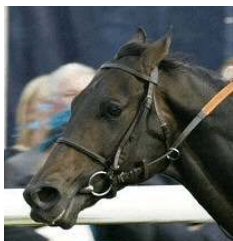
Bago