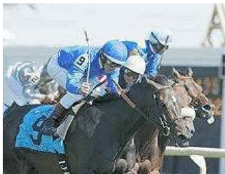
Crimson Palace

Godolphin Racing has announced that Crimson Palace (SAf) (Elliodor {Fr}--Perfect Guest {SAf}, by Northern Guest) will miss the GI Breeders' Cup F/M Turf and will now be retired. The five-year-old had not raced since winning the GI Beverly D. S. at Arlington Park Aug. 14.