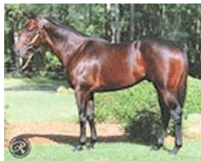
Successful Appeal www.walmac.com

STUD FEE SET FOR SUCCESSFUL APPEAL Successful Appeal (Valid Appeal--Successful Dancer, by Fortunate Prospect), who was recently relocated from