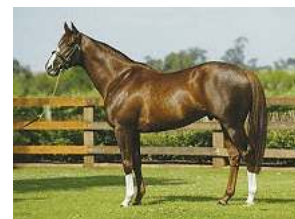
Giant's Causeway

We will no doubt be hearing a lot more of these fillies, as My Typhoon was impressive on her debut at Saratoga and Mona Lisa, in my opinion, was unlucky not to go close to winning last month's G1 Meon Valley Stud Fillies' Mile--she was stopped in her tracks at a crucial stage before rallying for fourth place.