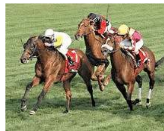
Perfect Soul (#7)