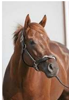
Smarty Jones