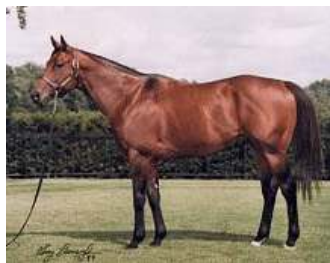
Elusive Quality