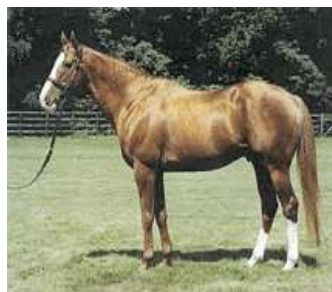
Annie Edge's son Selkirk