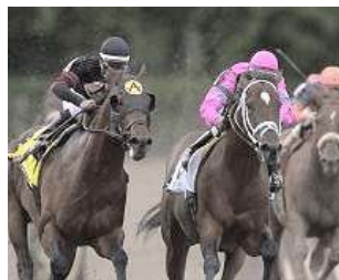
Saint Liam (inside) in the Woodward S.