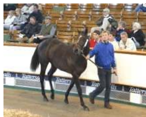
Hip 916 Tattersalls