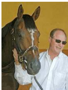
Pleasantly Perfect