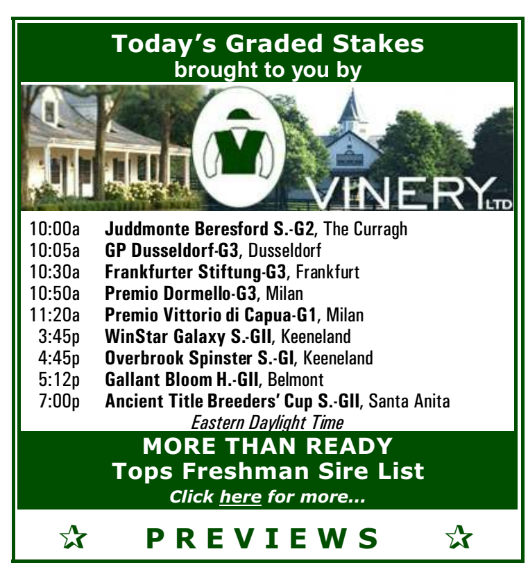
Sunday, Keeneland, post time: 4:45 p.m. EDT OVERBROOK SPINSTER S.-GI, $500,000, 3yo/up, fm, 1 1/8m