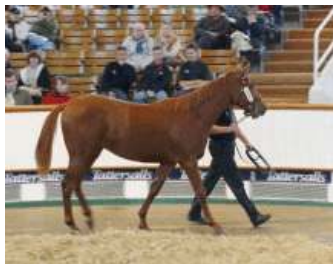
Lot 237 tattersalls.com