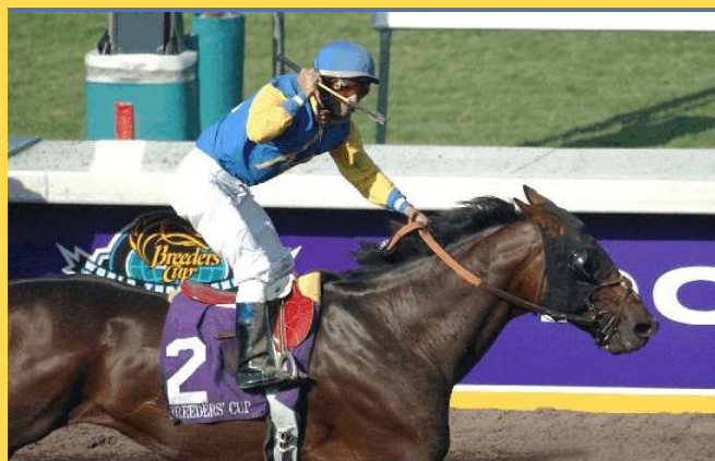
PLEASANTLY PERFECT wins '03 BC Classic

MOVING??? DON'T FORGET TO LET US KNOW YOUR NEW FAX NUMBER! 1 (732) 747-8060