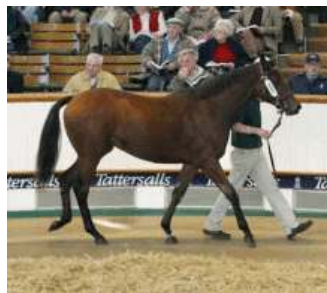
Lot 283