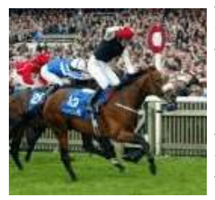
Refuse to Bend www.darley.com

REFUSE TO BEND TO KILDANGEN Classic winner Refuse to Bend (Ire) (Sadler's Wells--Market Slide, by Gulch) will begin his stud career at Darley's Kildangan Stud in Ireland upon his retirement at the end of the current racing season. A Group 1 winner in all three seasons on the track, the bay capped off an undefeated