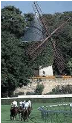
Longchamp Action Plus