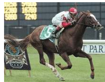
Kitten's Joy