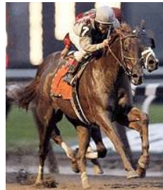
Funny Cide