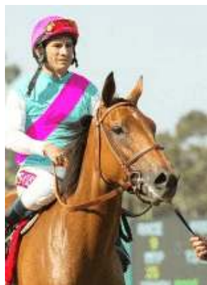
Light Jig

layoff. Two-for-five while racing in France, Amorama was on the board in three of her first U.S. outings and closed well in the 10-furlong GI American Oaks at Hollywood July 3 to run fifth, beaten just four lengths by winner Ticker Tape (GB). The dark bay was given a break after that effort, then returned to earn her first U.S. victory when beating Ticker Tape by a nose in the Aug. 21 GI Del Mar Oaks. "Her form was good in France, but she always runs good in the U.S.,"