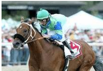
Love of Money