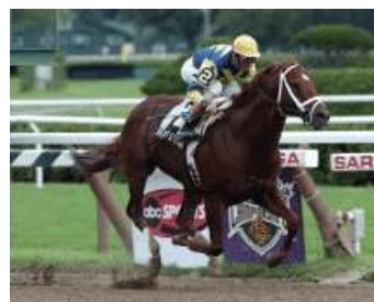
Speightstown

Speightstown meets the standard of a great sprinter--fast early, fast in the middle and fast late. That lethal combination makes him squarely the one to beat in this event which has produced six winners of the Breeders' Cup Sprint. Plagued by injury throughout his career, the six-year-old, making only his 15th start, is perfect in four 2004 efforts, including this track's GII True North Breeders' Cup H. June 5 and the GII A.G. Vanderbilt H.