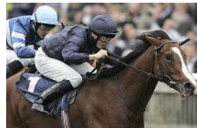
Ad Valorem