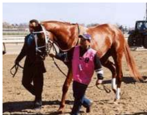
Eddington

Receiving some class relief here after facing top sophomores Smarty Jones and Birdstone, Eddington should find these more to his liking. The handsome chestnut made a name for himself earlier this season with consecutive scores at Gulfstream, but hasn't gotten his picture taken since. Last seen finishing third in the GI Travers S. Aug. 28, he looms the one to beat.