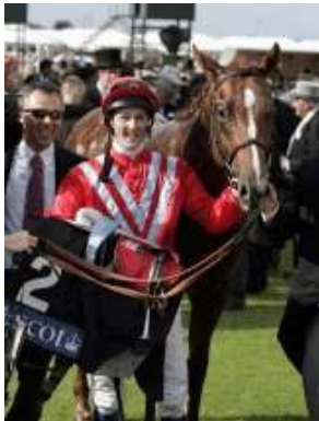
Chateau Istana