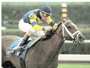
Harmony Lodge